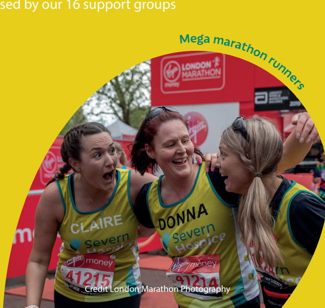
Mega marathon runners