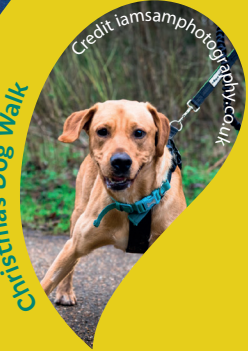
Christmas Dog Walk