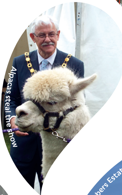
Alpacas steal the show