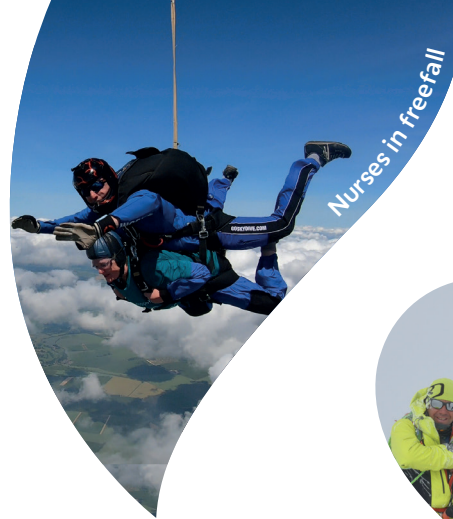
Nurses in freefall