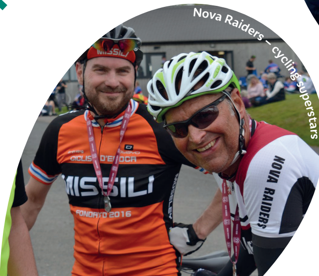
Nova Raiders – cycling superstars