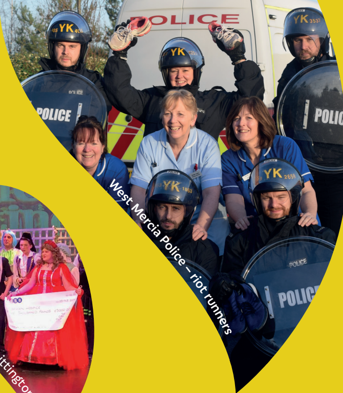
West Mercia Police – riot runners