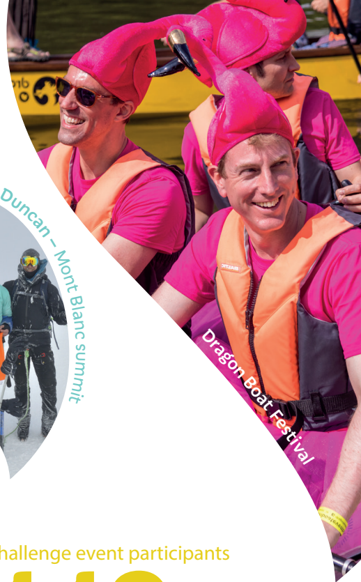
Dragon Boat Festival