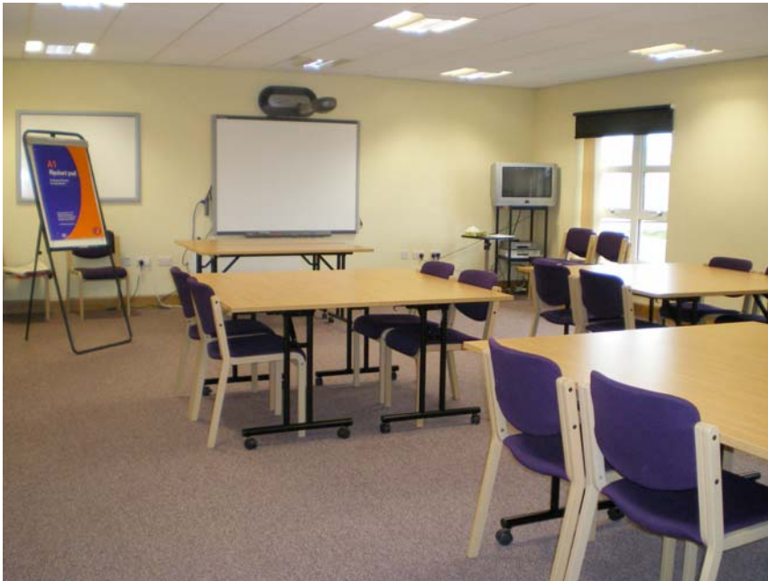
Lecture and Seminar Rooms